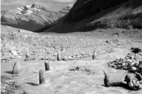
Figure 2. Sheared stumps in growth position protruding from an ice proximal meltwater channel along the northern terminus of the Saskatchewan Glacier in September, 1999. Radiocarbon dates of 2,830 \pm 60 (Beta 135586) and 2,870 \pm 60 (Beta 135587) ^{14}\text{C} years B.P. were obtained from the perimeter of two of the stumps.

including a significant mid-19th Century advance and a less extensive event during the early and middle parts of the 18th Century (Figure 2). Evidence for pre-LIA events comes from detrital wood found on ice proximal outwash deposits at various times over the last two decades (Luckman et al. 1993, 1994). The oldest samples date between 3,200 to 2,500 ^{14}\text{C} years B.P. (Table 1) and provide circumstantial evidence for an advance equivalent to the Neoglacial Peyto Advance (Osborn and Luckman 1988; Luckman et al. 1993; Luckman 1993, 1996).